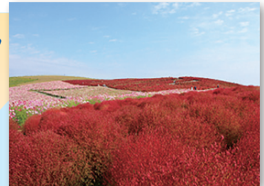
Hitachi Seaside Park