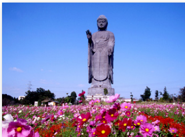
Ushiku Daibutsu (Tallest Buddha)