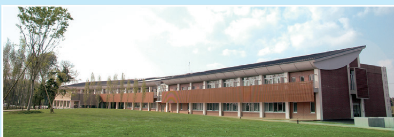
Ibaraki Kasumigaura Environmental Science Center (IKESC)