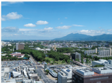
Tsukuba Science City